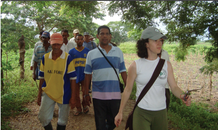
Members of FCSPP, accompanied by PBI in a visit to El Caracol Farm in Guaimaro, Colombia