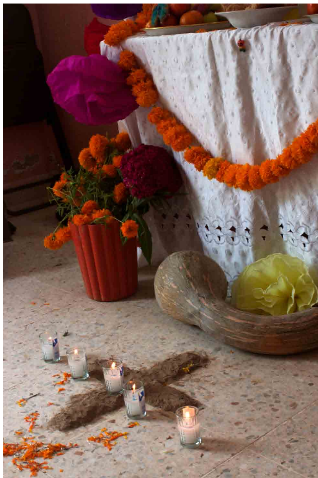
Day of the Dead offering in the AFADEM office at the time of excavations

Despite serious human rights violations, the government continues to opt for a military response to the country's problems of violence. Looking forward to the federal elections in 2012, it will be essential for presidential candidates to take the protection of human rights and of those that defend them into account in their electoral programmes, as their work is a fundamental basis for the country's democratic development.