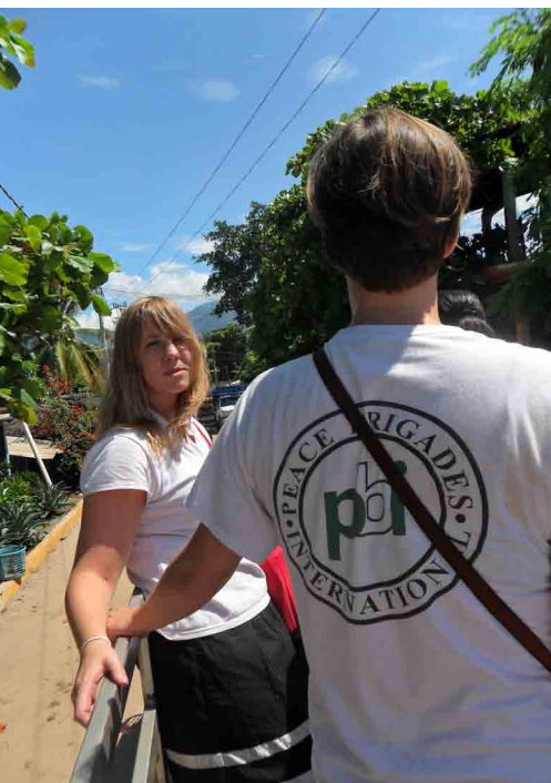
PBI volunteers in Petatlán (Guerrero) during an accompaniment with the OMESP

Basilian Human Development Fund (Canada) Biskaia Lawyers Bar (Spain) British Embassy in Mexico Canadian Embassy in Mexico – Canada Fund Catalan Agency for Development and Cooperation (Spain) Civil Service for Peace (Cooperation and Development Ministry of Germany) Diakonia (Germany) Foreign Affairs Ministry of France French Development Agency (Agence Française de Développement) (France) Fund for Nonviolence (United States) Law Society (United Kingdom) Misereor (Germany) Non Violence XXI (France) Overbrook Foundation (United States) Santander Municipality (Spain) Sigrid Rausing Trust (United Kingdom) Valladolid Municipality (Spain) Valladolid Provincial Council (Spain) Zivik (Germany) PBI Country Groups (Germany, United Kingdom, Belgium, Switzerland, Italy, Canada)