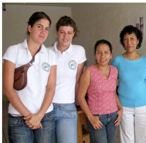
PBI volunteers with members of the 25 November Committee in Oaxaca, in November 2010.

I have been in Mexico since then, working as a volunteer with PBI and learning about and accompanying men and women human rights defenders in Oaxaca. I'm happy to see the fruits of their work to win justice or a more dignified life for others, but I also see the danger they face just for defending human rights. To know people who dedicate – and sometimes even risk – their lives for the rights of others is something that can truly change your life.