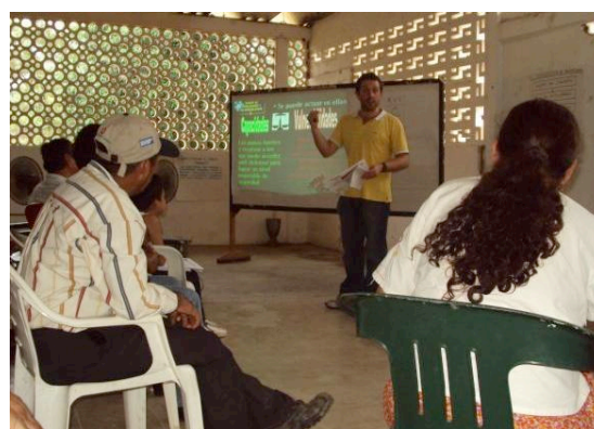
PBI security workshop with AFADEM members in Atoyac, Guerrero, in September 2010.

In 2010, PBI trained 115 men and women HRDs from 10 organisations who work on various issues, including indigenous rights, the struggle against impunity and migrants' rights. Grassroots groups working in rural areas have received training, as have organisations running some of Mexico's most emblematic cases and the regional offices of large international bodies.