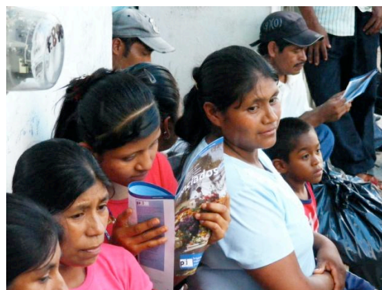
Activists relatives of OPIM defenders detained in Ayutla prison reading a PBI's bulletin "Silenced", Ayutla, Guerrero, August 2009.