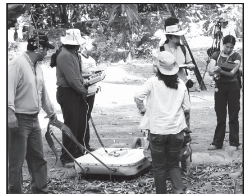
Scanning of the territory where the Municipal Town Hall in Atoyac is located.