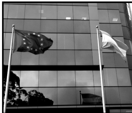
Flags flying outside the offices of the European Union Delegation to Guatemala.