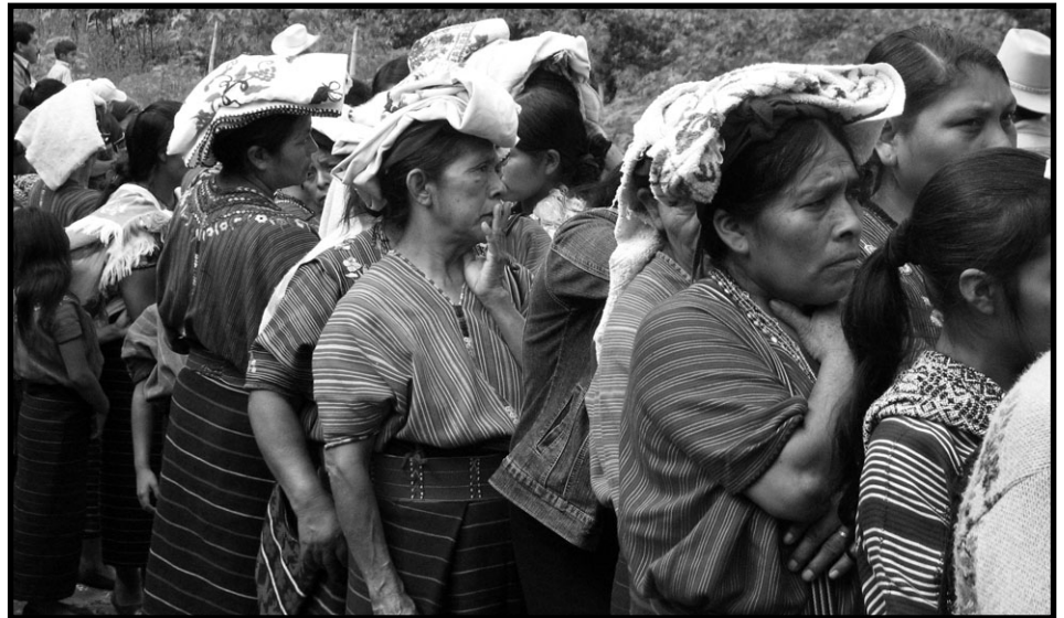
Women waiting to register during the community consultation in San Sebastian, Huehuetenango, October.