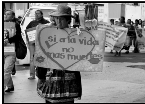
Demonstration on 26 November 2007, for International Day of No Violence against Women, Guatemala City.

Guatemala occupies 98 th place in the Women’s Development Index, an indicator that illustrates the obstacles