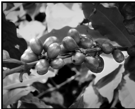
Coffee maturing on the branch.

It's the text that says: "I was hungry and you gave me nothing to eat, I needed clothes and you did not clothe me, I was in prison and you did not visit me, I was sick and you didn't take care of me..."