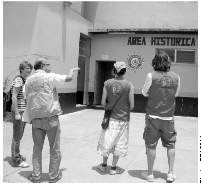
PBI volunteers during a visit to the Historical Archives of the National Police in Guatemala City in June 2011.

A variety of Guatemalan and international Human Rights organizations celebrated the finding of this collection of documents. Do you believe it might be met with opposition