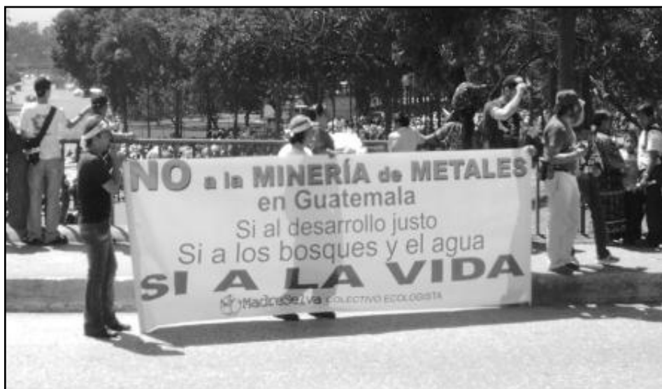
Participation of Madre Selva in a protest in the in the capital.