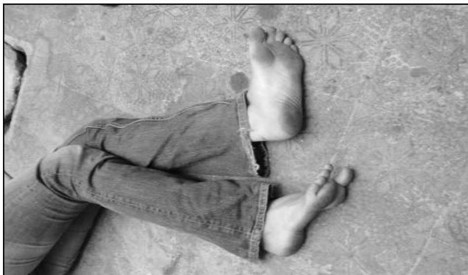
Some social activists say that the large amount of supposed gang members appearing dead each day could respond to a social cleansing strategy.