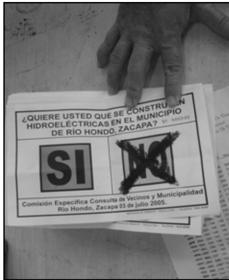
Community consultation regarding hydroelectric powerstations in Rio Hondo, Zacapa.

The lack of water has become an everyday phenomenon on a nation-wide scale. For the Director of the National Institute of