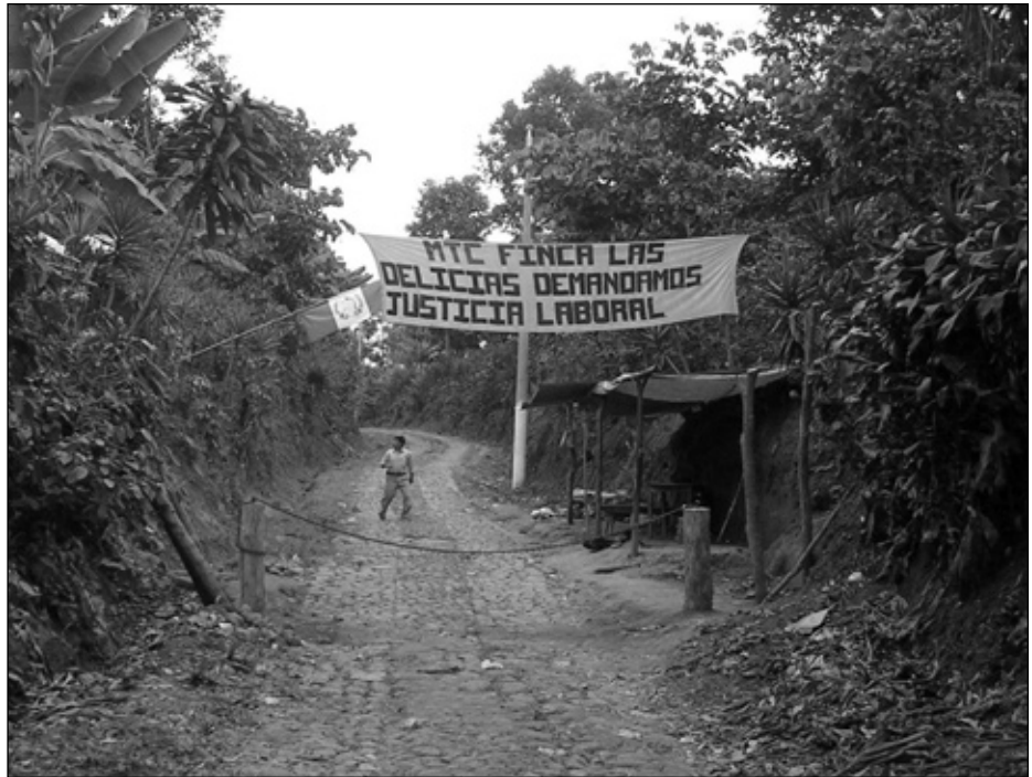
A banner of the Movement of Campesino Workers (MTC) in the Estate Las Delicias, San Marcos.

Specifically in the department of San Marcos, the Movement of Peasant Workers (MTC) evaluated in 1997 that 303 properties accounted for around half the department's land mass, which means that of the approximately 9,000 inhabitants of San Marcos, 303 own almost half the department. 3