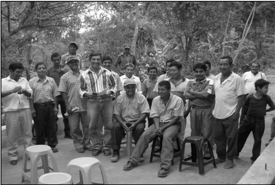
Campesinos fired from the San Jerónimo and La Fábrica estates in San Marcos.

of private property. On the contrary, one of the campesinos leaders of the Las Delicias Estate in San Marcos argues that, “they say we are invading but I say we are not invading, we have a right to be here. The invaders are you people who have come; you are invaders, because who knows where you came from. We are not invading because we were born here and live here, already we have grown old here and we will die here... we have every right to this land.” 14