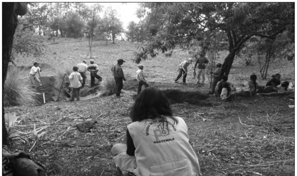
PBI accompanying CONAVIGUA during an exhumation in Buena Vista, Sacapulas.

On the 5 th April, it was announced that on the previous day, the Court of Constitutionality (CC) had judged valid the community consultations that were carried out in Rio Hondo, Zacapa, and in Sipakapa, San Marcos, in June 2005, concerning the presence of a hydroelectric power station and the mining industry in the respective areas. The result of the consultations showed the discontent of the population with the presence of hydroelectric and mining activity in their territory. The consultations were strongly supported by the Madre Selva Collective and were observed by,