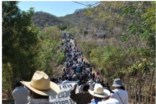
Second anniversary Pacific Resistance La Puya, 02.03.2014

This month we continued to accompany members of the pacific resistance to court hearings: specifically at the start of the month to observe a court hearing that was opened against three of it's members. The 18 th we accompanied the accused to another hearing where they presented evidence. They are still waiting to appear again in more hearings planned for April.