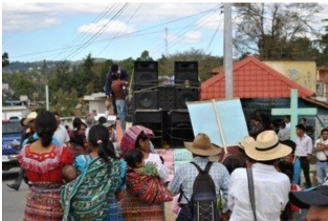
Second anniversary of the popular consultation in Chinique (Quiché), 14.03.2014

This month we kept regular telephone communication with the Council of the K'iche' people (CPK) . The 13 th of March we accompanied members of the CPK to a march that recognized the second anniversary of the popular consultation in Chinique (Quiché) where they rejected mining in the area. Around 100 marched from the centre of the community.