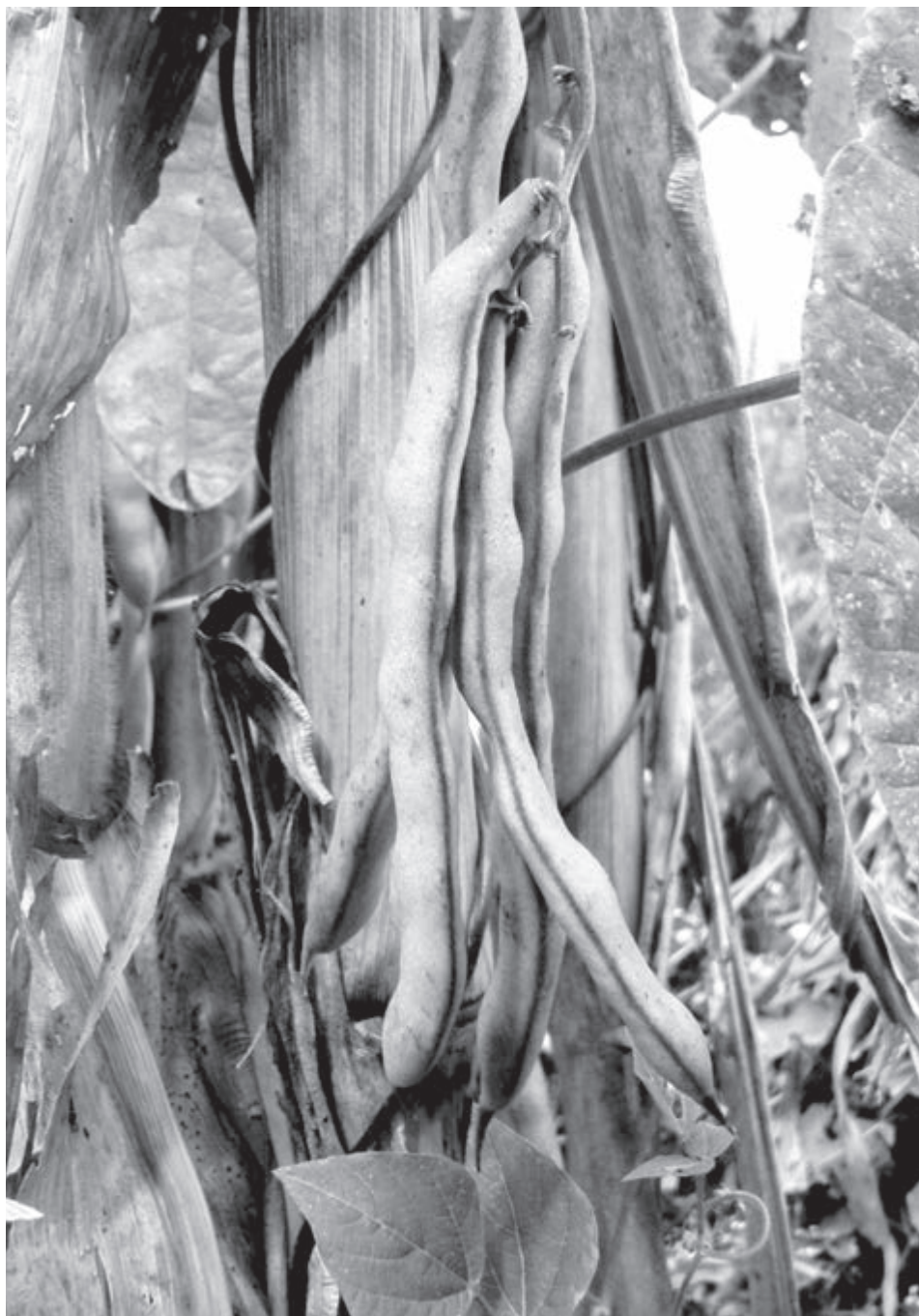
Beans planted by a family in Chinique, Quiché. November 22, 2017.

In light of such a discouraging outlook, it is necessary to delve into the causes as Guatemala has a wide gamma of natural resources, as well as governmental resources destined to guarantee the right to food. According to scientist César Azurdia the bottom of the matter is that wealth is not distributed in a just manner, because our country is one of the most unequal in regards to resource distribution. What happens is that biodiversity is used by developed nations, ones that give it a value added and it stays there. Sometimes it comes back, but one must pay for this. For example, modified seeds and patents. We can also have good corn, but what lands are available to our farmers? Small plots, two small plots... if they have land, so what is that richness if they cannot develop it. This is a topic that goes beyond biodiversity, it is a