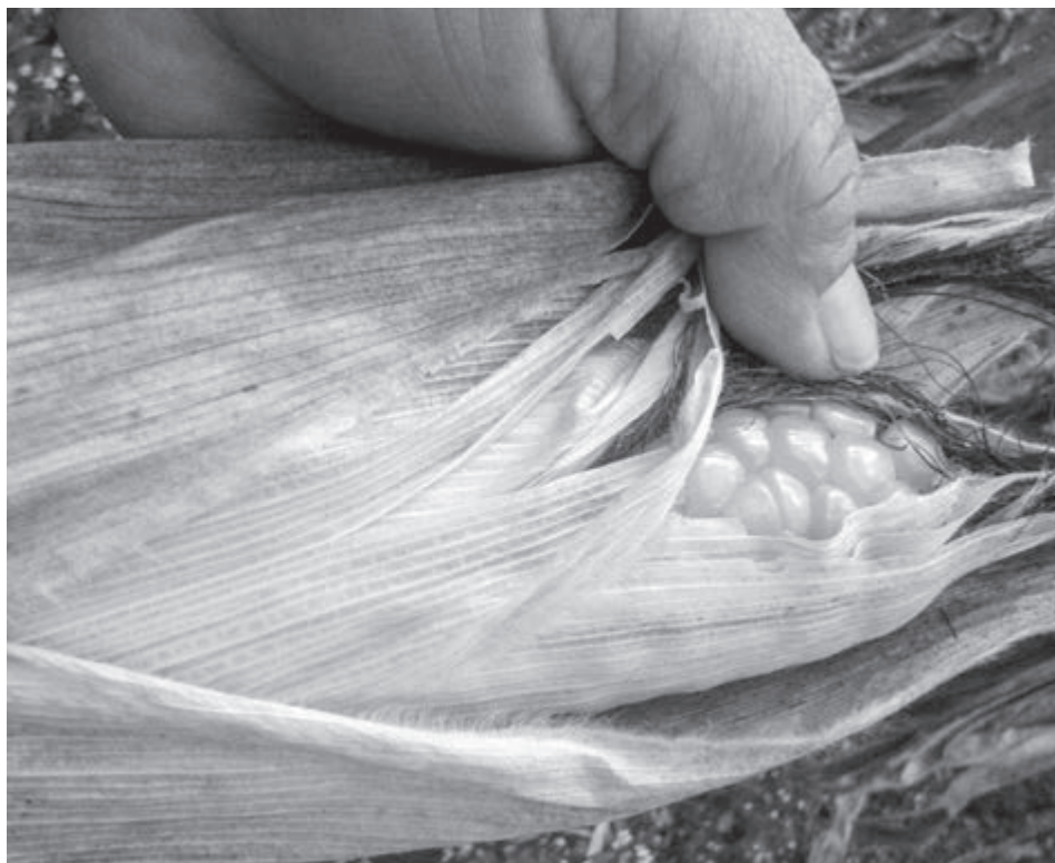
Recently picked corn for family consumption in Chinique, Quiché. November 22, 2017.

(RECMURIC), women possess only 15 percent of land in Guatemala, which has disastrous consequences for them, their families, their communities and the country as a whole: The lack of land impedes women from accessing other resources and essential services like credit and technical assistance. Without a plot of land as collateral it is not possible to obtain a formal loan. Also, it excludes them from the majority of state programs for productive investment and technical assistance, which often require beneficiaries to have their own land to produce. On the other hand, land is one of the main factors that condition power relations. It has been demonstrated that women without land are more subordinate to men and participate less in family and community decisions. When women do not have their own assets their ability to safeguard their wellbeing is weaker which makes them more vulnerable to sexist violence. On the contrary, when women exercise their right to land other rights are strengthened, their self-esteem and social acceptance increase. Given the limited possibilities that rural women have to obtain their own income, owning an asset like land translates into a significant change which allows them to advance in their economic autonomy. It has been shown that this also impacts family wellbeing when women have a say in family spending as they usually prioritize investment