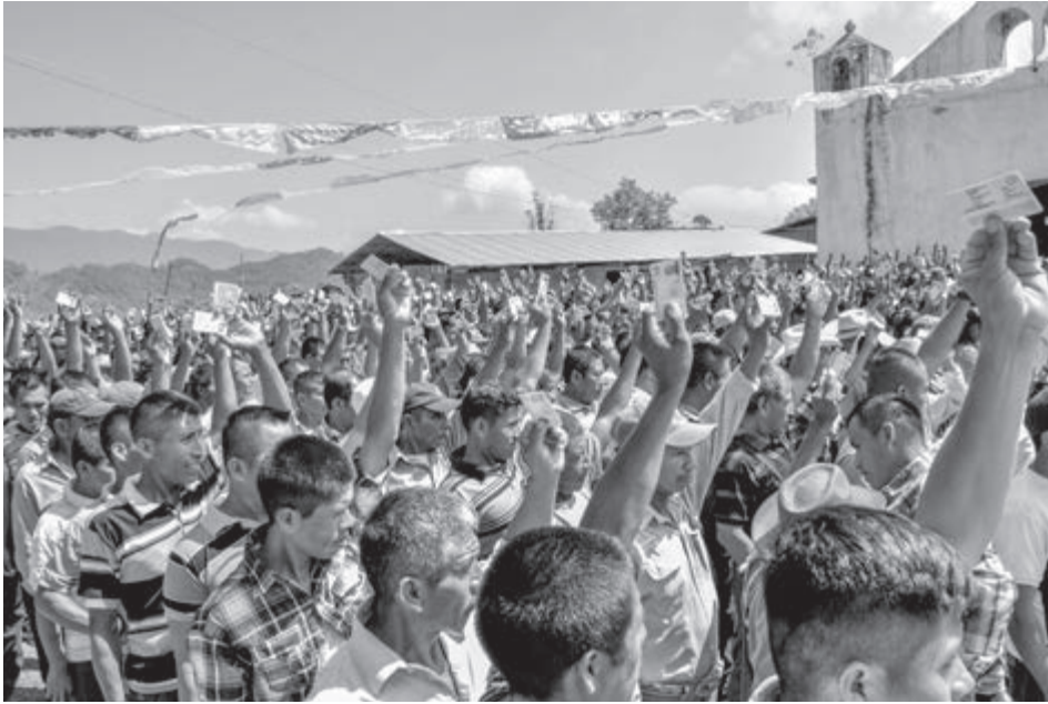
Community consultation Cahabón. Pinares community, Guatemala, August 25, 2017.

We are not in agreement that the company continues to manipulate our brothers. With lies they are gaining the trust of people. Since 2012 they have offered large projects and they do not follow through. A few people benefit, but everyone else stays the same. For this reason, many people who signed, now do not believe in the company 11 .