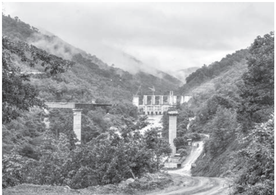
Panoramic view of Oxec hydroelectric dam. Guatemala, May 12, 2017.

PBI was present at the community consultation on August 27. This was the start of our accompaniment to the Peaceful Resistance of Cahabón.