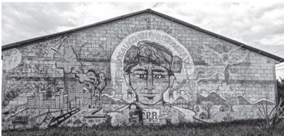
Mural in community hall, Primavera del Ixcán.

One of the ongoing struggles of the community is reparations and collective redress as victims and survivors of the internal armed conflict. Eulalia Matías summarizes it in the following manner: reparations were part of the Peace Accords, they have to fulfill for the uprooted populations. But the government does not have interest nor political will, they are never going to comply. They told us "there is no land for