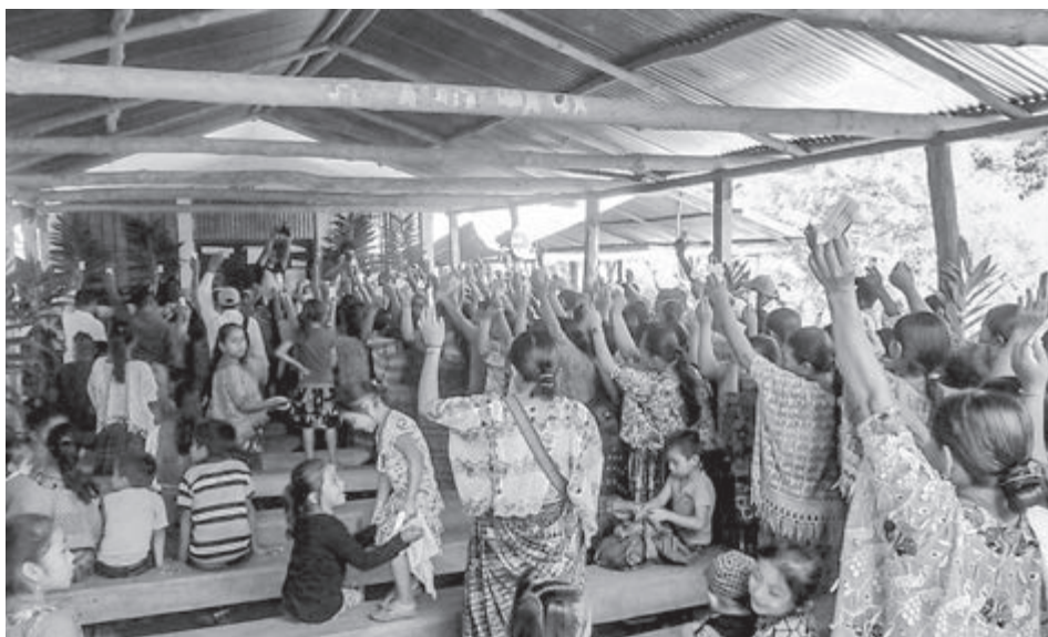
Community consultation Cahabón. Salac I community, Guatemala, August 25, 2017.

What is happening today with the waters of Oxec is far from the wise ancestral ways of the indigenous