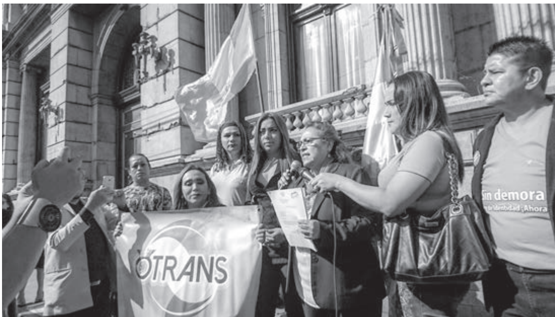
Congresswoman Sandra Morán presents bill on gender identity. Guatemala, August 3, 2017.