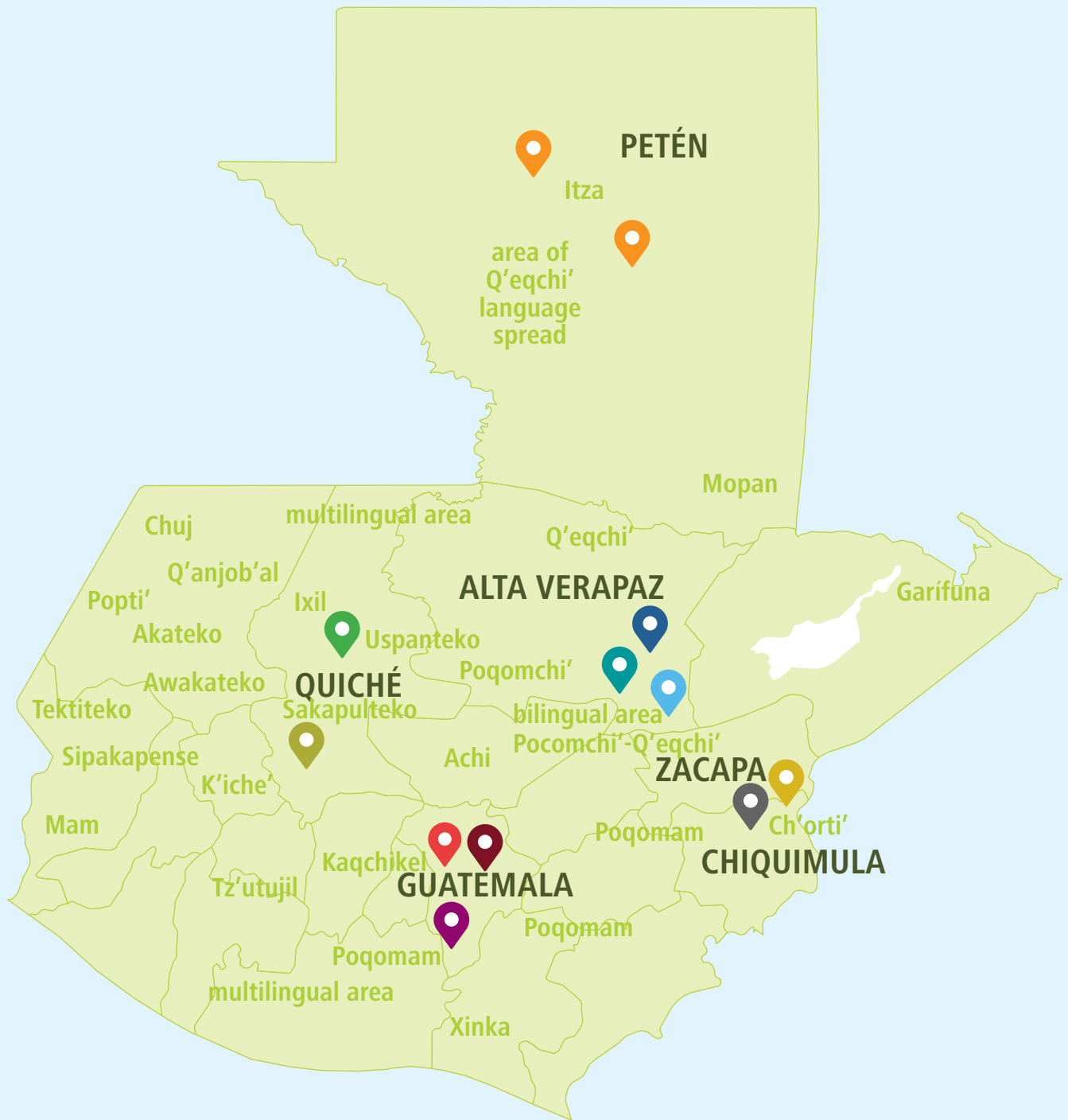
MAYAN, XINKA AND GARÍFUNA LANGUAGES