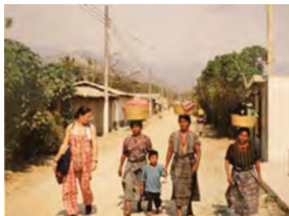
Acompañamiento a la Asociación para el Desarrollo Integral de las Víctimas de la Violencia en las Verapaces, Maya Achi (ADIVIMA), Rabinal, Baja Verapaz, 1997.

Depending on the skills and experience of the committee members, we support the following areas: finances and fundraising; personnel management; publications; training volunteers; analyzing current events; and security. Supporting the on-the-ground team is constant with weekly communication or more frequently depending on the situation.