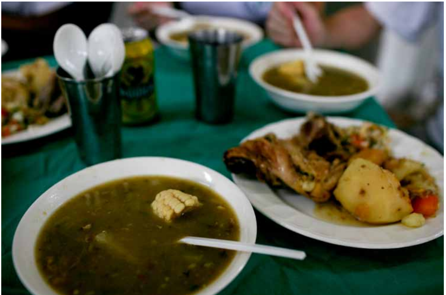
Lunch at OFP community kitchen.