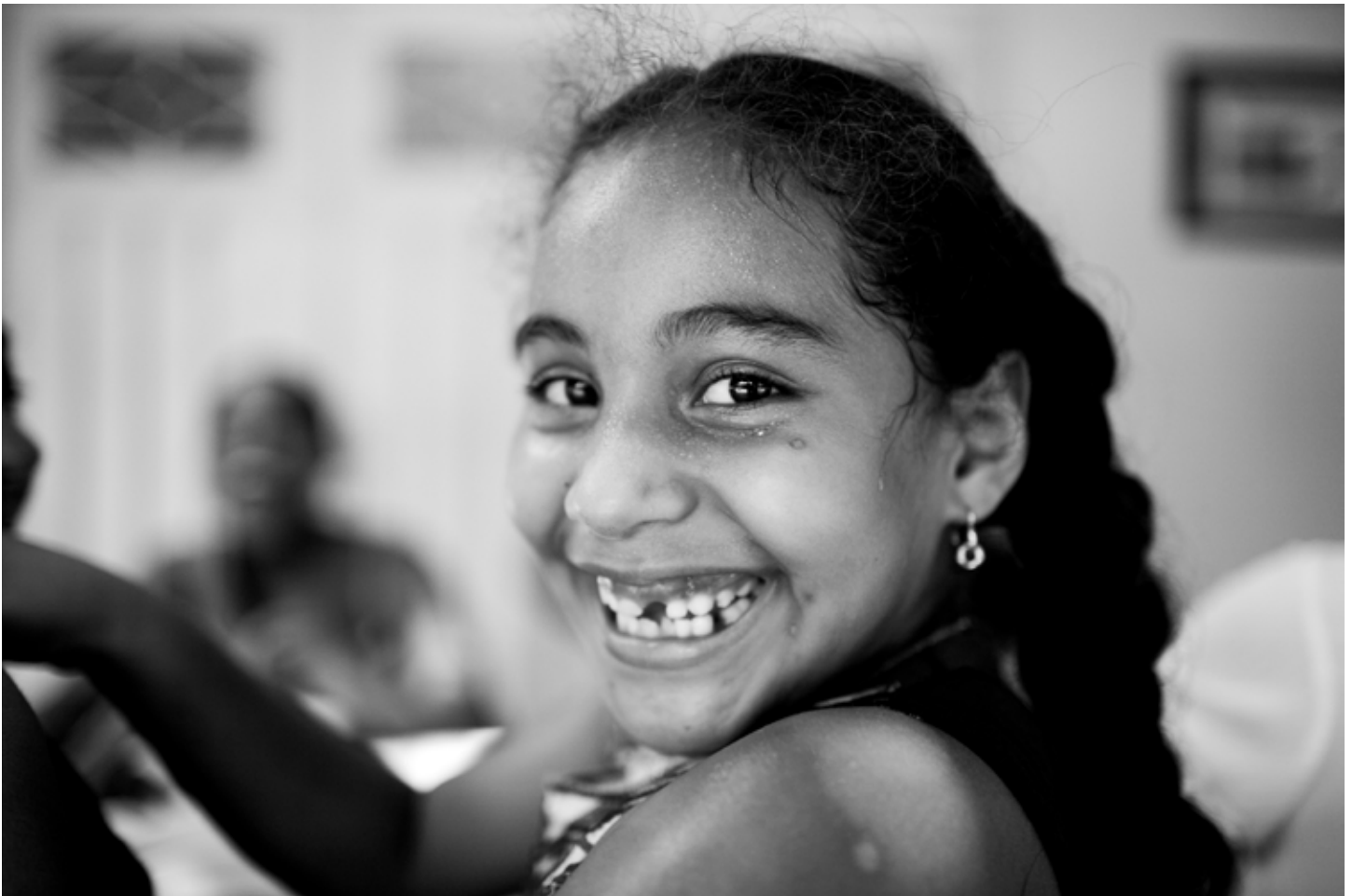
Lunch at OFP community kitchen.