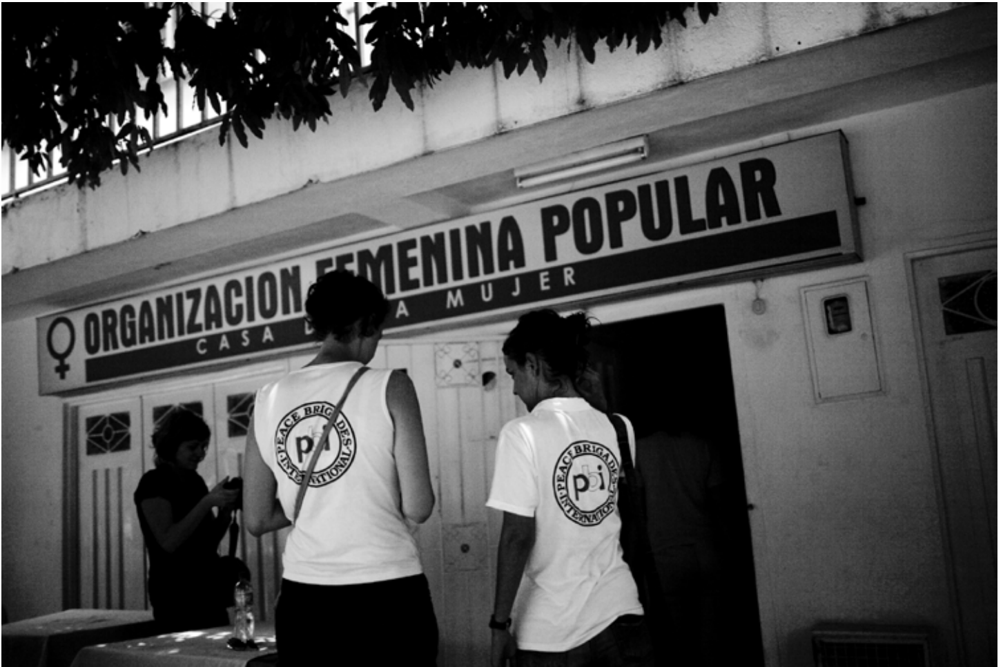
PBI members in front of OFP offices in Barrancabermeja.

PBI HAS ACCOMPANIED THE GRASSROOTS WOMEN'S ORGANISATION SINCE 1995.