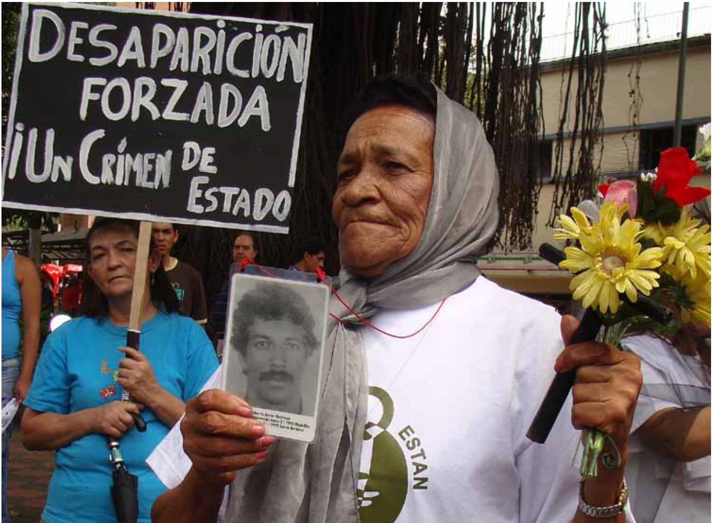
Action against forced disappearance; commemoration in Medellín.

The NGO Association of Family Members of the Detained and Disappeared (ASFADDES) has fought for the right to truth, justice and comprehensive reparation in Colombia since 1982. PBI has accompanied ASFADDES members since its arrival in the country in 1994.