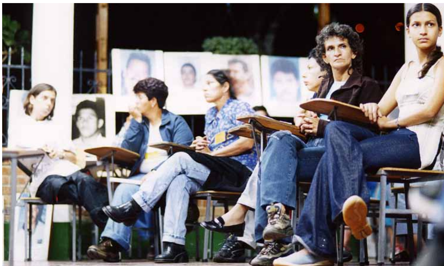
Action against forced disappearance.

7. In this monthly letter, PBI reports on the illegal and systematic interceptions and harassment carried out by the Administrative Department of Security (DAS) against different human rights organisations, including ASFADDES.