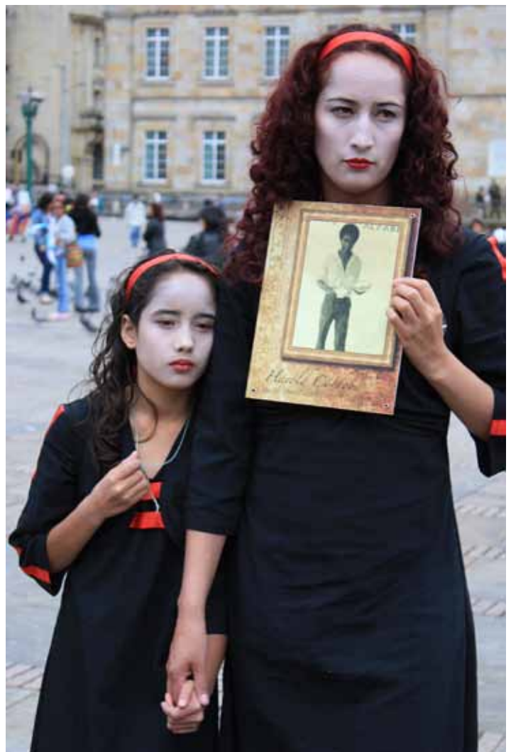
Action against forced disappearance commemorating the International Week of the Disappeared, organized by ASFADDES in Bogotá in May 2009.

«ASFADDES is the first and oldest victim's organisation in Colombia. We are family members of disappeared persons who have come together to work for Truth, Justice and Comprehensive Reparation. With respect to justice, we follow up on cases and organise victims, no longer only with the family members of disappeared persons, rather with victims of State-sponsored crimes» 3 .