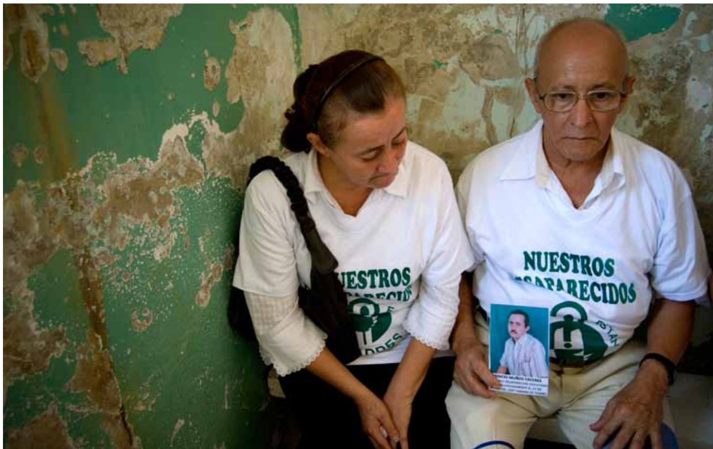
Family members of a person who disappeared in 1994 are waiting for the delivery of the body.