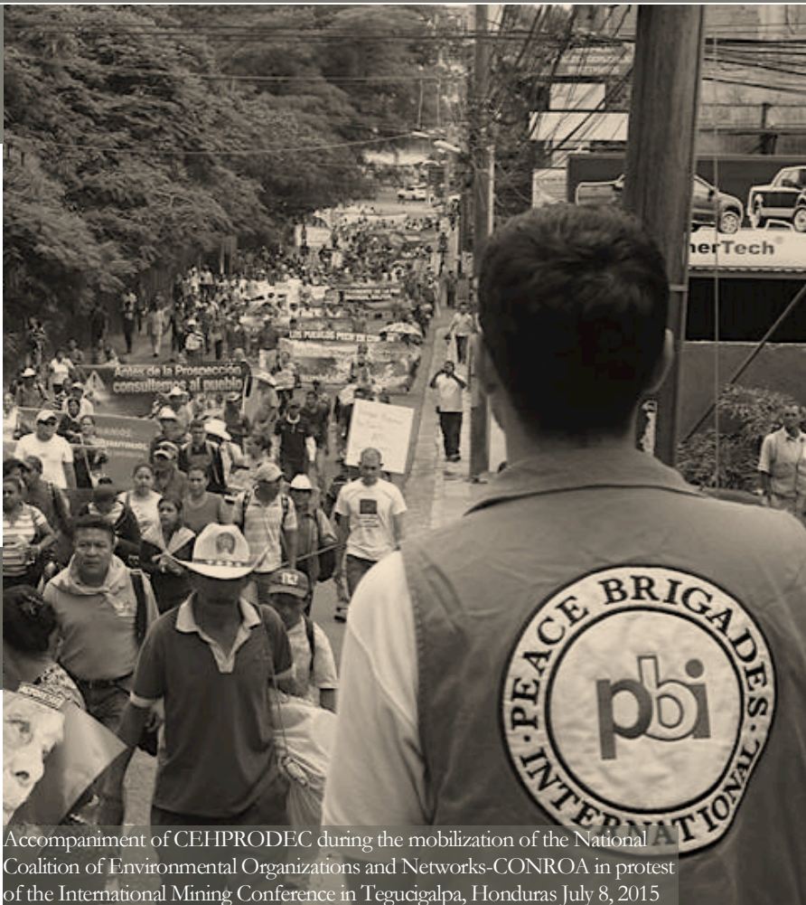
Accompaniment of CEHPRODEC during the mobilization of the National Coalition of Environmental Organizations and Networks-CONROA in protest of the International Mining Conference in Tegucigalpa, Honduras July 8, 2015