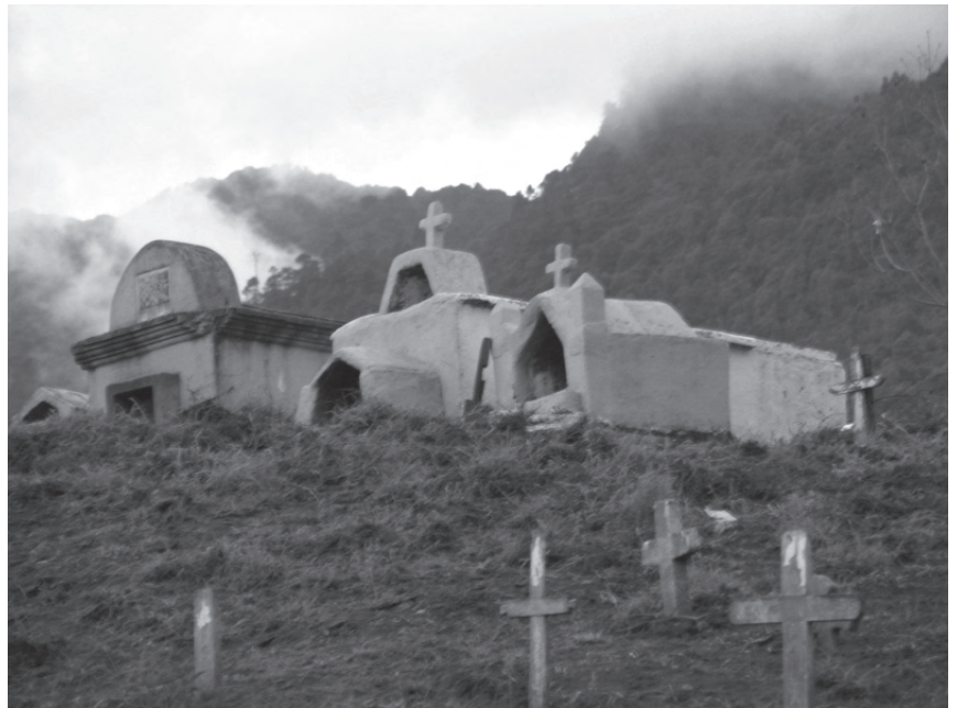
The last battles of the internal conflict were fought in the misty hilltops in the background. Nebaj, Ixil region, Quiché Department.