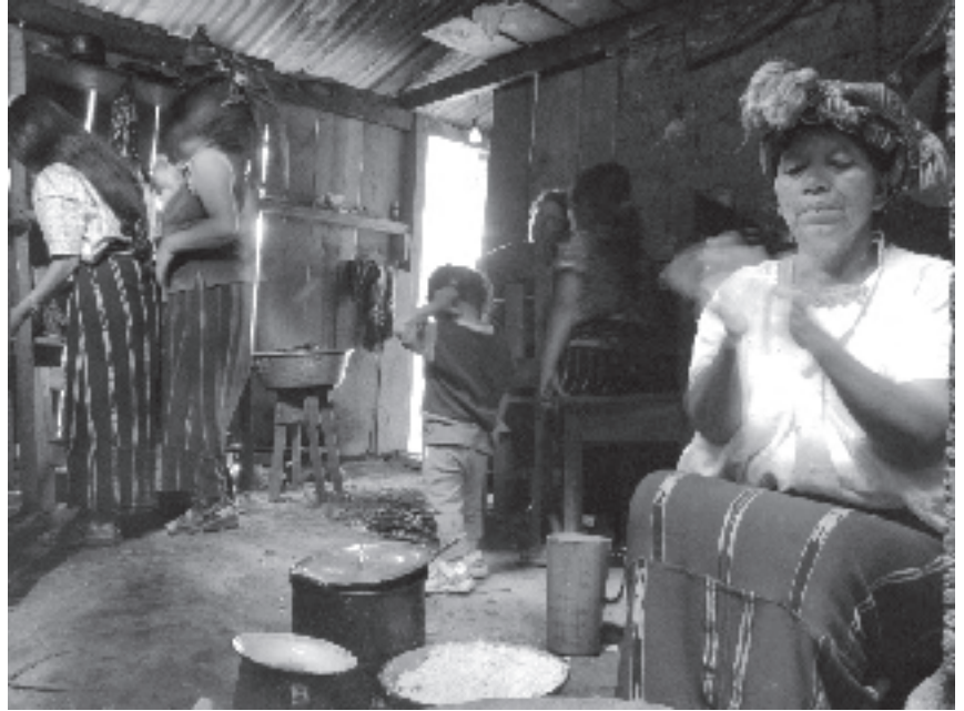
The family of an activist accompanied by PBI prepares breakfast.