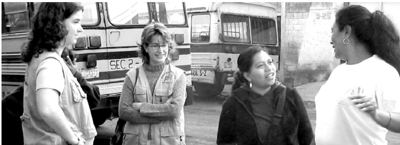
PBI Volunteers with members of SITRA-NB

In 2004, the general human rights situation in Guatemala, according to the International Observatory for the Protection of Human Rights Defenders, "continued to be one of the most disturbing of Latin America". Land evictions with associated human rights violations such as murders and destruction of homes quadrupled in 2004 as compared to the previous two years. The United Nations Verification Mission in Guatemala (MINUGUA), closed in November leading to fears of a further deterioration in the situation. Human rights defenders have suffered particularly, with an alarming increase in threats, office break-ins and assassinations in rural areas. PBI is receiving more requests for accompaniment than ever before.