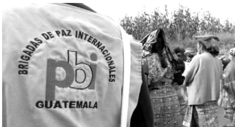
A PBI Volunteer accompanies the National Coordination of Guatemalan Widows, (CONAVIGUA) in Guatemala