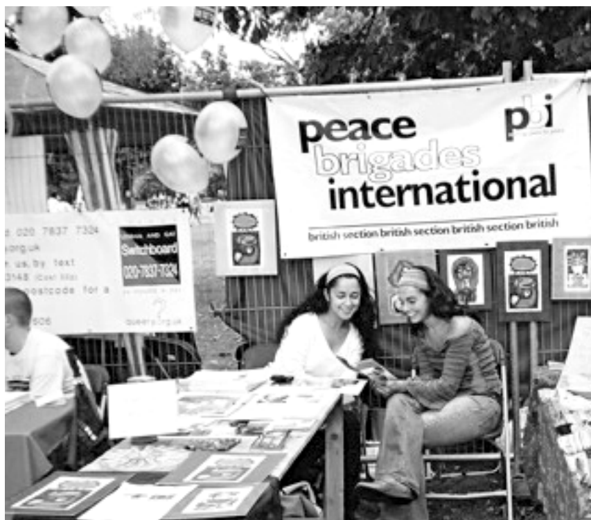
The PBI stall at the "Respect" Festival

Raising awareness directly protects individuals at risk. 2004 produced a range of opportunities for PBI to present its work at public events.