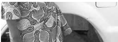
PBI met with human rights organisations in Rwanda, DRC and Burundi