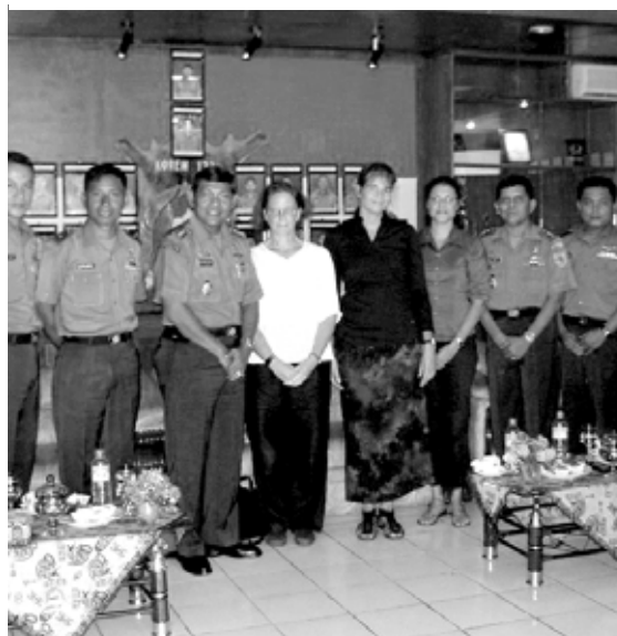
The Papua sub team meets the regional military commander

The assessment team has concluded that there is indeed a need for PBI in post-tsunami Aceh, with many client and other organisations and activists expressing their desire to have PBI stay in the province. The needs range from protective services to coordinating and facilitating stress management and peace building workshops, among others. PBI is absorbing the cost of the assessment mission but we have started an appeal to raise £50,000 to re-launch PBI's presence in Aceh.