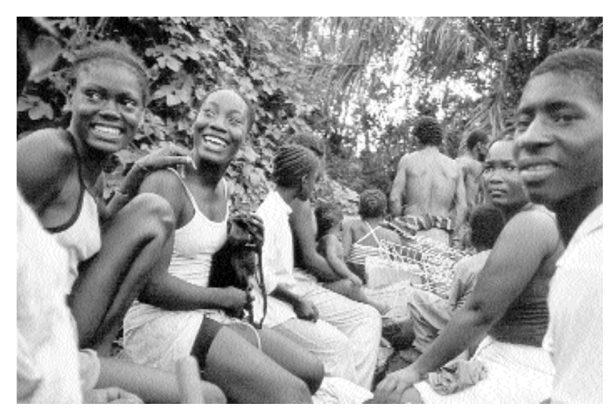
A happy return for some members of the displaced community of Cacarica. PBI accompanied them during the return.