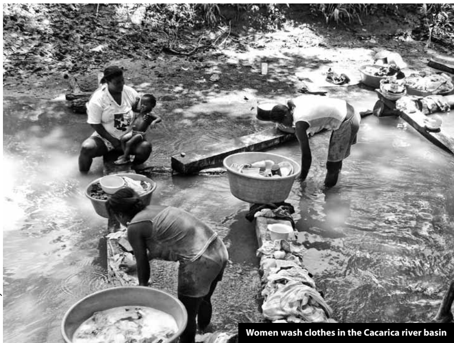
Women wash clothes in the Cacarica river basin