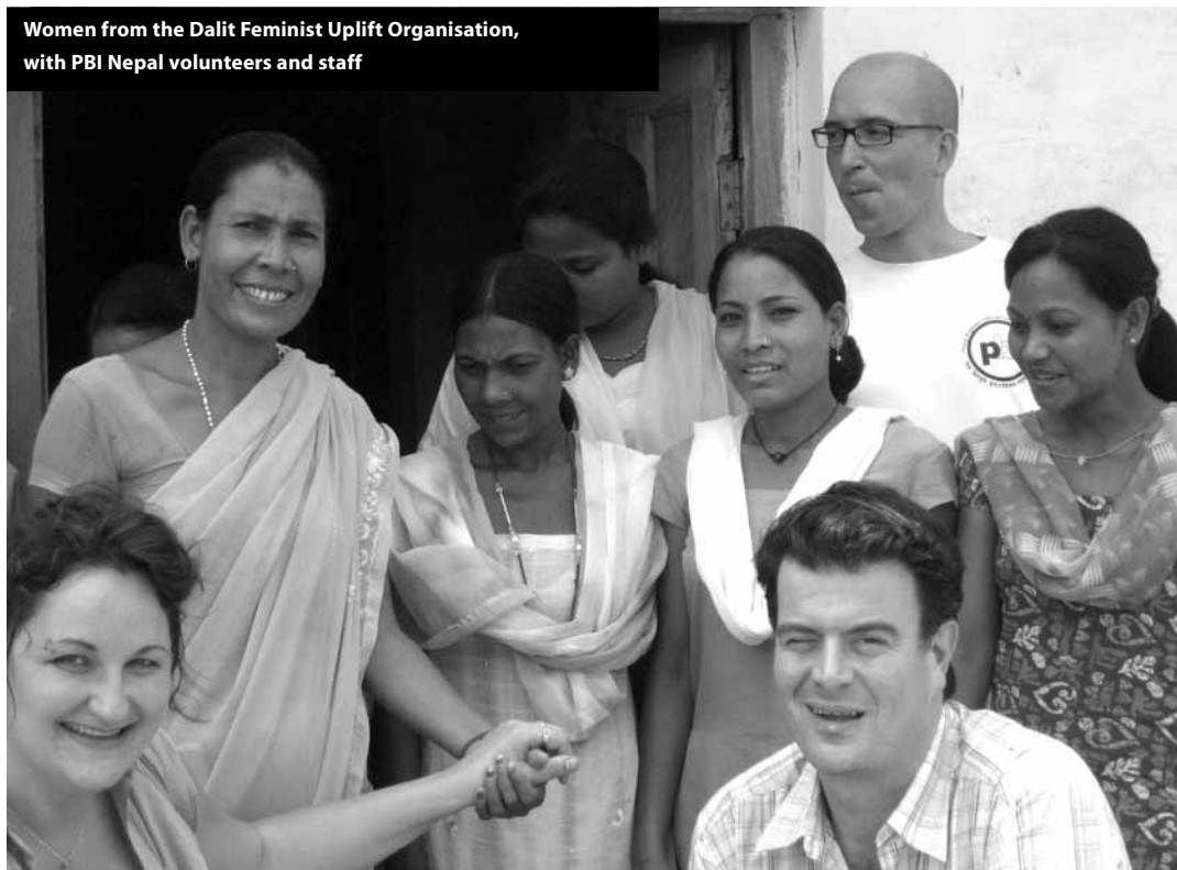
Women from the Dalit Feminist Uplift Organisation, with PBI Nepal volunteers and staff

In 2009, PBI began to accompany DAFUO, an NGO established by Dalit women in 1997. Broadly focussed on women's rights, DAFUO currently works primarily on domestic violence and rape cases against Dalit women. Women speaking out against domestic and sexual violence frequently face threats themselves, and PBI's accompaniment provides protection to DAFUO's members presenting these reports.