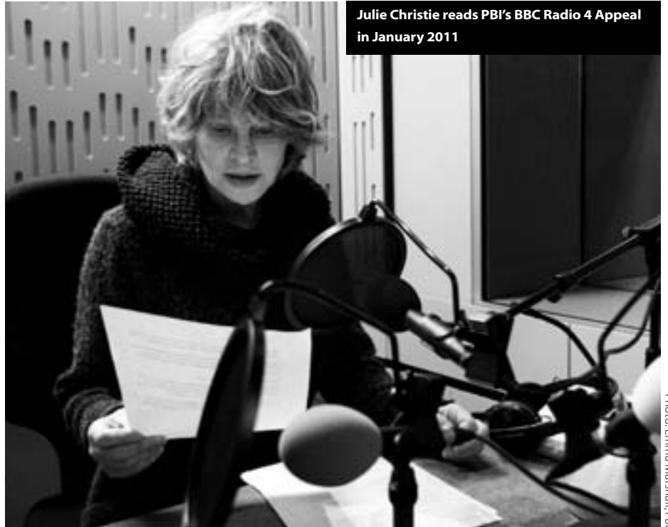
Julie Christie reads PBI's BBC Radio 4 Appeal in January 2011