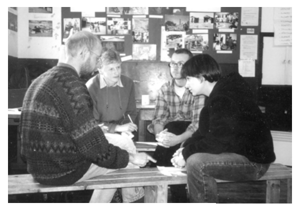
Team work in action at the Orientation weekend

I will happily admit that I knew little or nothing about PBI when I signed up for the Orientation weekend. In fact my reasons for doing so seem a bit hazy, even now. I can vaguely remember reading somewhere about non-violence, self-evaluation and stress management and it has to be said, being unaware of PBI's international the expectations for tree-hugging type activities appeared to be guite high. As I trekked through the Buckinghamshire countryside, greeted by only the occasional speeding BMW, towards a log cabin in the middle of apparently nowhere, the cynic in me was starting to have serious doubts about the whole idea. I was proved wrong.