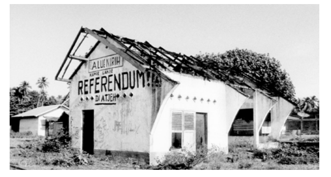
On the road from Banda Aceh there are 53 checkpoints of the TNI (Indonesian Army) and mayburned houses. This one was burned by "unknown people". Kamoe Lakee Referendum di Atieh = We want Referendum in Aceh

I'm conscious and accepting of the risk we take by voluntarily exposing ourselves to a conflict between armed groups. But for the locals, the danger is greater. We can resort to our strong support network, to our foreign passports and evacuation plans, whereas these people are likely to lose their jobs, their freedom, their health – everything.