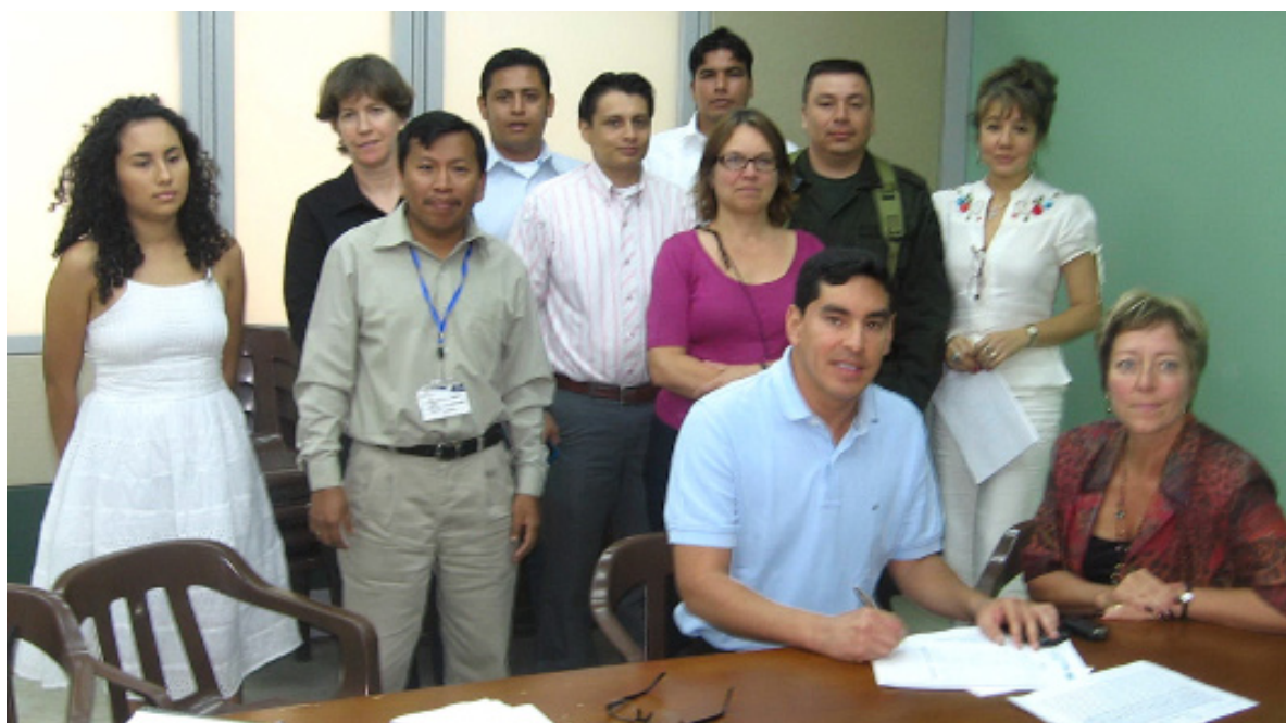
Caravana lawyers and representatives of the South-Colombian Lawyers and Professionals Corporation witnessing the signing of a document outlining some of the human rights commitments of the departmental government.

In the Indigenous Reserve La Reforma, in Huila, for example, despite Constitutional recognition of the right of indigenous peoples to control their designated territories, the military had established a base in close proximity to the community, having taken possession of two community buildings. During the visit of the Delegation to La Reforma, an agreement was made between the indigenous government and the 9th Brigade of the Armed Forces for the latter to remove itself from the community within one year. A written agreement was signed between the Governor and an official from the 9th Brigade. The Secretary of the Huila departmental government also signed an agreement with the Delegation stating that it will follow up on the reported abuses at the La Reforma Reserve.