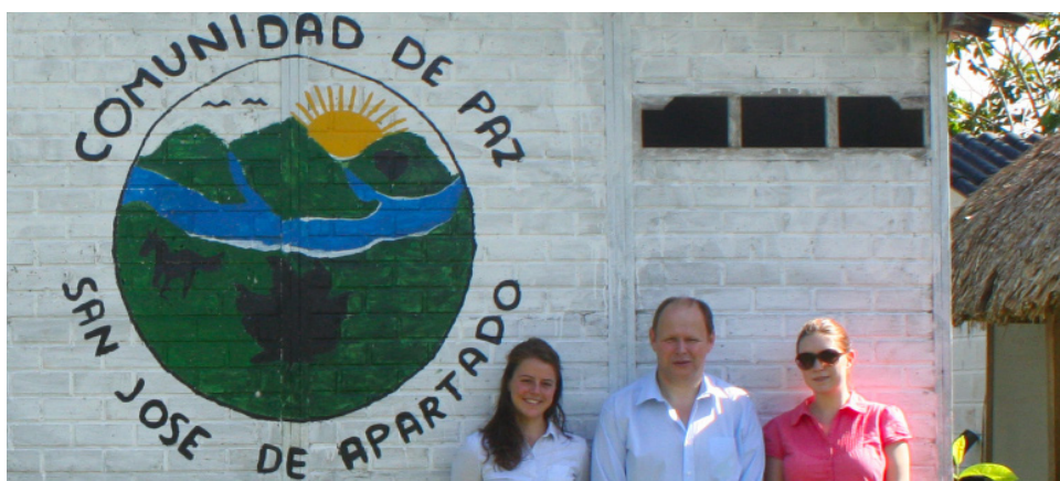
Caravana delegates in the San Jose de Apartadó community

The delegates were concerned by the high levels of impunity for killings in the Community, particularly the 6 massacres of the past 13 years. The delegates learnt that with regard to the 2005 massacre, there had been some legal proceedings, following the confessions of two paramilitaries of their involvement. Their confession implicated 10 members of the military. However, despite these testimonies, all implicated army personnel were acquitted.