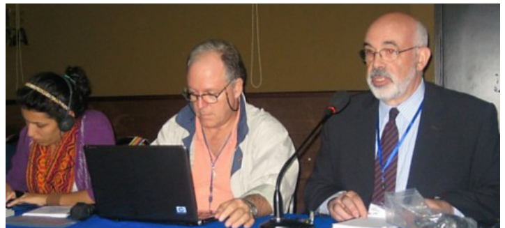
Caravana lawyers from Canada and the UK presenting their findings in Bogotá

The climate of fear in which lawyers and legal professionals operate was very evident, and many people interviewed asked to contribute only on an anonymous basis to the report for fear of retaliation. Some human rights defenders interviewed did talk about the effects of the threats to themselves and their families.