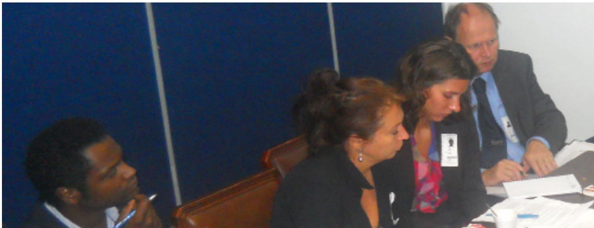
Caravana lawyers in meetings with authorities

Deputy Attorney General Pareja noted that in 2009 a unit was established in the Prosecution Department to deal with human rights issues focussing on crimes against lawyers. This unit consists of only eight prosecutors. Deputy Attorney General Pareja committed to sending a message to the Delegation with information on statistics on how many cases it deals with and what progress has been made with them. He also informed the Delegation that the Human Rights Liaison Office, contrary to what delegates had been informed by that office, maintains statistics on cases presented to it, but that they are reluctant to disclose this information.