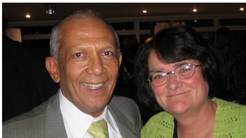
CAJAR and Caravana lawyers.

The Delegation is also concerned by the current administration's recent public pronouncement against the decision of a judge and its resultant failure to respect the principle of the independence of the judiciary. 20