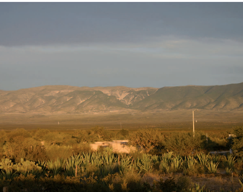
Panoramic view of the Sierra de Real de Catorce in San Luis Potosí

In August 2010, the Santa Catalina community confirmed that there were concessions already granted in Wirikuta and that they faced an imminent mining threat. AJAGI accompanied the first on site inspection requested by the indigenous community of Santa Catalina and performed an analysis of the environmental and social impact that would be caused by the mining operations by First Majestic. According to information provided by the