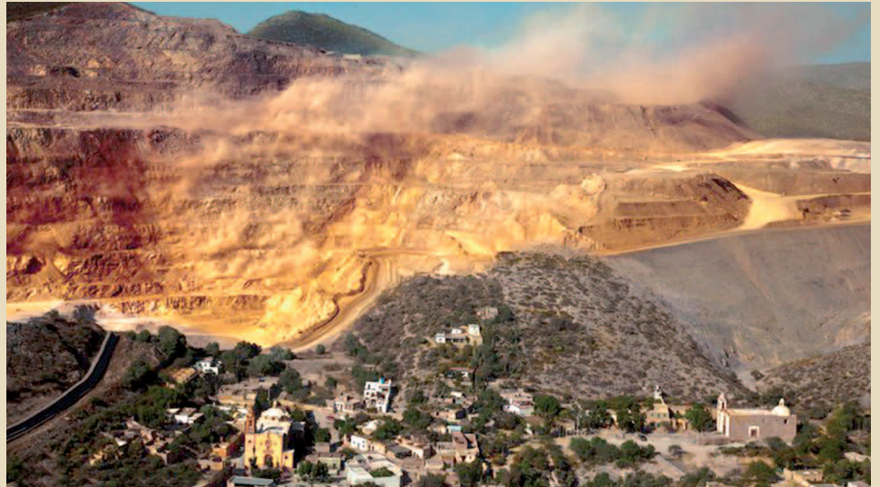
Panoramic view of Cerro San Pedro, San Luis Potosí

The Broad Opposition Front (Frente Amplio Opositor, FAO) is a group of grassroots organizations and environmentalists who denounce that San Xavier, a company that is part subsidiary of the Canadian transnational corporation New Gold Inc., is carrying out illegal mining activities. San Xavier operates in Cerro San Pedro, San Luis Potosí. Many members of FAO have suffered from attacks and threats as a result of their petitions to close the mine.