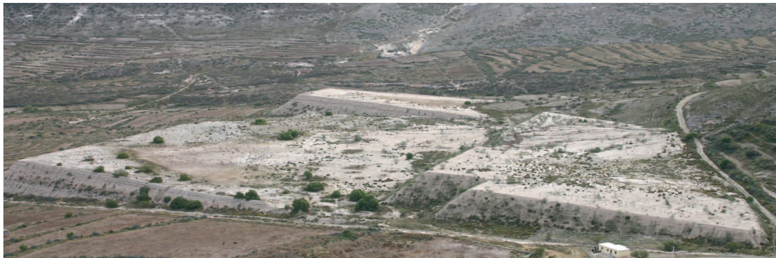
Land deposits in El Potrero, Real de Catorce

dams.” The tailings dams contain residue of toxic waste material that accumulates over the years, and contain extremely dangerous heavy metals such as lead, antimony, or arsenic. Tunuary says that “the official norms and scientific research indicate that healthy limit of antimony is 9 parts per million before it begins to cause damage to a living organism. In a sample of sludge collected in the area of Real de Catorce and analyzed in a laboratory at the University of Guadalajara, we found 54