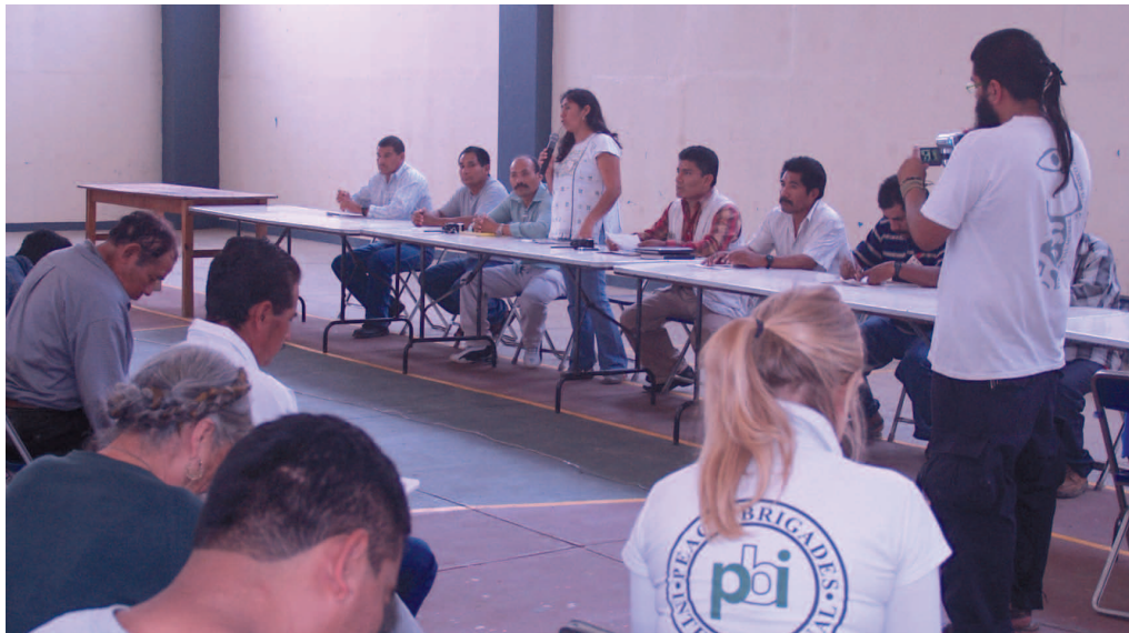
PBI provides accompaniment to staff from Barca-DH during the IV Regional Forum of the Sierra Sur in Zenzontepec, Oaxaca

Barca-DH’s work includes workshops about the rights that are affected, including the community’s rights as indigenous people, and agricultural rights. “We explain the rights and obligations that they have as communal land owners, and the duties of the [community authorities including] the Commissioner of Communal Property and the Community Assembly. We tell them about the rights they have as indigenous people according to state law, the Constitution, and international treaties and conventions. We want them to know that the people can defend their land rights and can say ‘no’.” ■