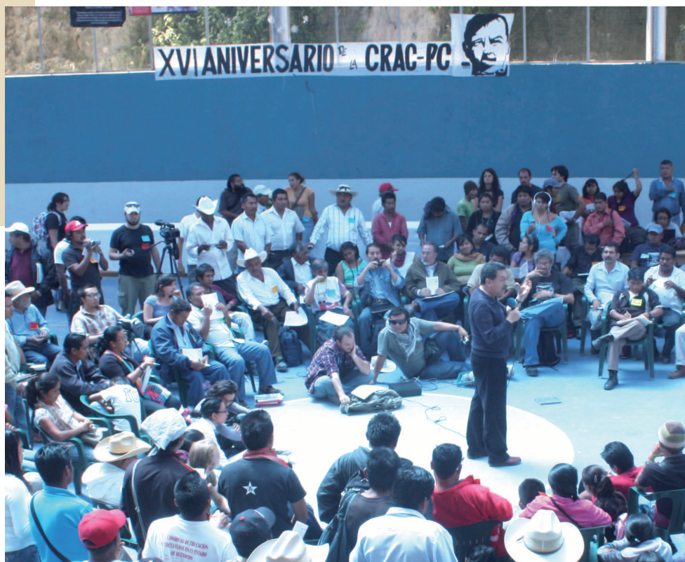
Discussion group during the CRAC's XVI anniversary

Private companies are given permission to enter a region with the support of the federal, state, and municipal governments. In the municipality of San Luis Acatlán there are 7 or 8 concessions.