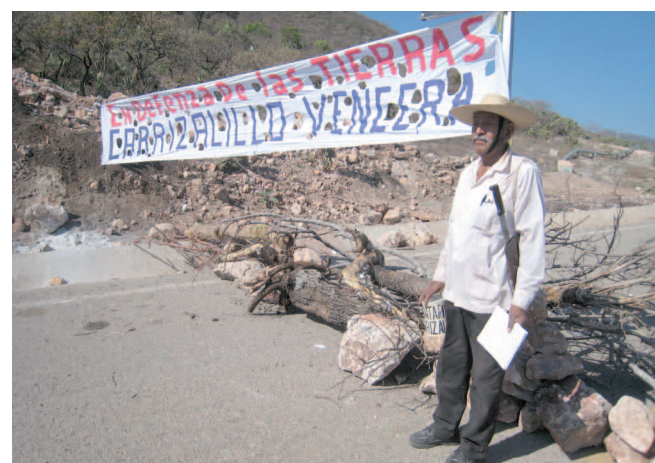
Farmer from Carrizalillo protests against mining

In our experience, we have found that one of the best ways to protect economic, social, and cultural rights and to fight for a life with dignity, does not come from the individual, but instead through solidarity and collective organizing. ■