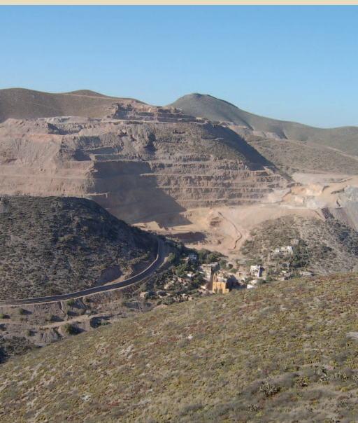
View of the Mine in Cerro San Pedro, San Luis Potosí

In this publication, PBI gives a voice to the human rights defenders who are faced with big economic interests and who are fighting for their right to the land and to a clean environment. Many of them have been the object of violence because of their work. PBI also wants to provide visibility to the contradictions, the interests at play, and the human rights violations that take place in the context of these mining projects. During the development of this publication, PBI spoke with experts and human rights defenders that promote and protect the rights of communities affected by mining in the states of Guerrero, Oaxaca, San Luis Potosí, Baja California and Durango. ■