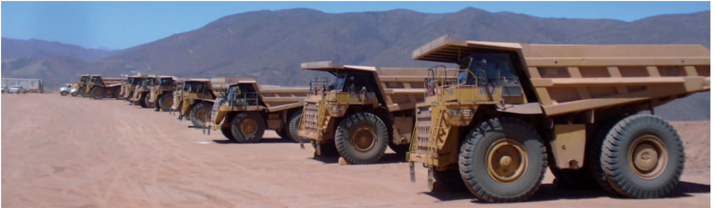
Mining project los Filos-Bermejil in Mezcala, Guerrero

In 2005, the North American company Goldcorp and its Mexican subsidiary LuisMin, obtained a concession to extract gold from an open pit mine in “Los Filos,” in the municipality of Eduardo Neri, in the Mezcala region of Guerrero. The conflicts quickly began. The company began to operate in areas in which it had no permission for ‘temporary occupation’ and the community claimed that it had not been informed or consulted properly. In 2007, the agricultural community of Carrizalillo created the Permanent Assembly of Landowners and Workers of Carrizalillo (Asamblea Permanente de Ejidatarios y Trabajadores de Carrizalillo, APETC), rejecting the mining of the land.