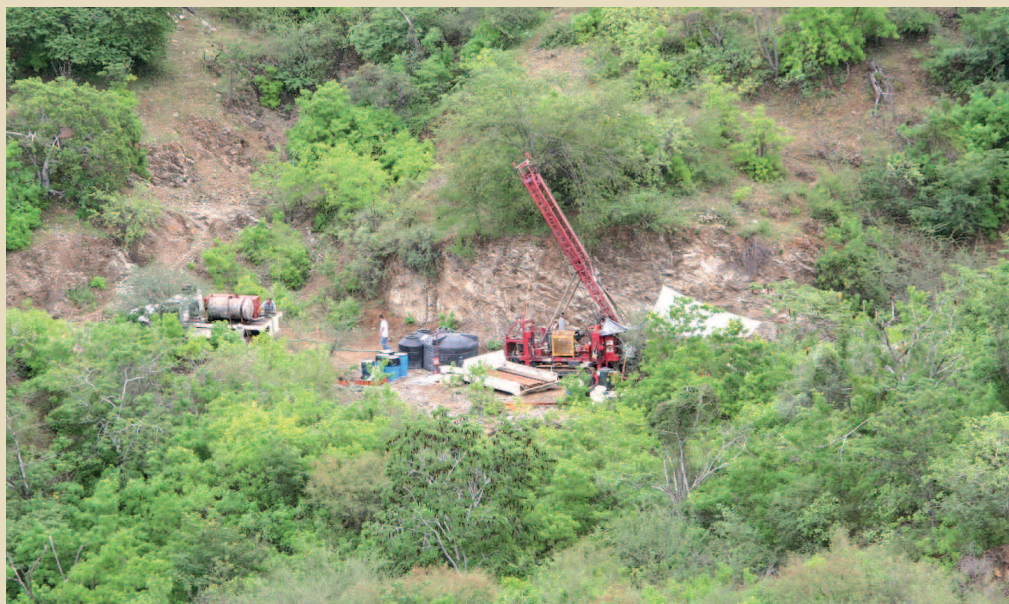
Paredones Amarillos mining project, Baja California