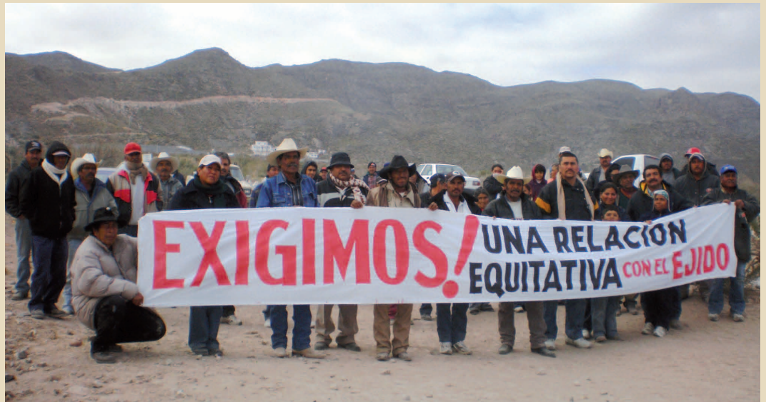
The Sierrita community protests for a more equitable distribution of resources