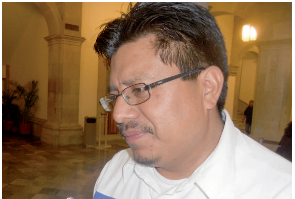
Minister of Indigenous Affairs for Oaxaca, Adelfo Regino Montes, during an interview

Whatever comes in the future will depend on the demands and the response of indigenous peoples. What a Government cannot do is come and divide people, as in other cases. This is a democratic government and it must respect the will of the people. This is our challenge; we have said that we are a democratic government, and now we have to prove it. ■