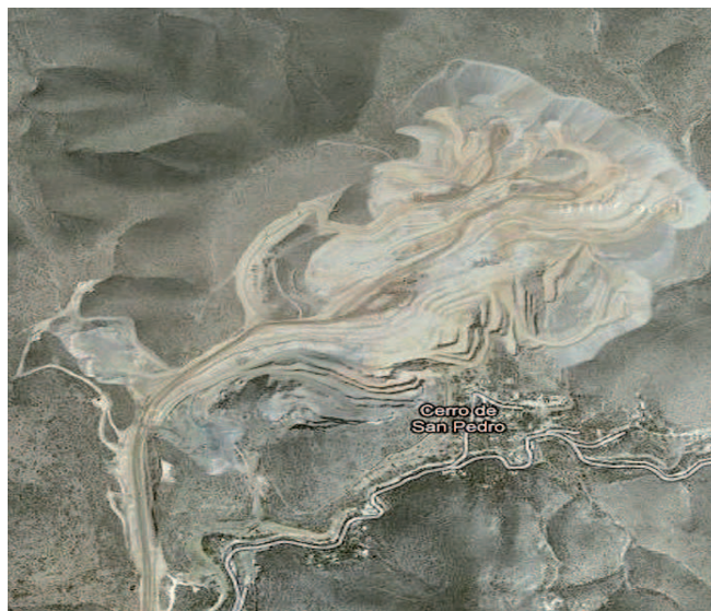
Satellite view of Cerro San Pedro, San Luis Potosí