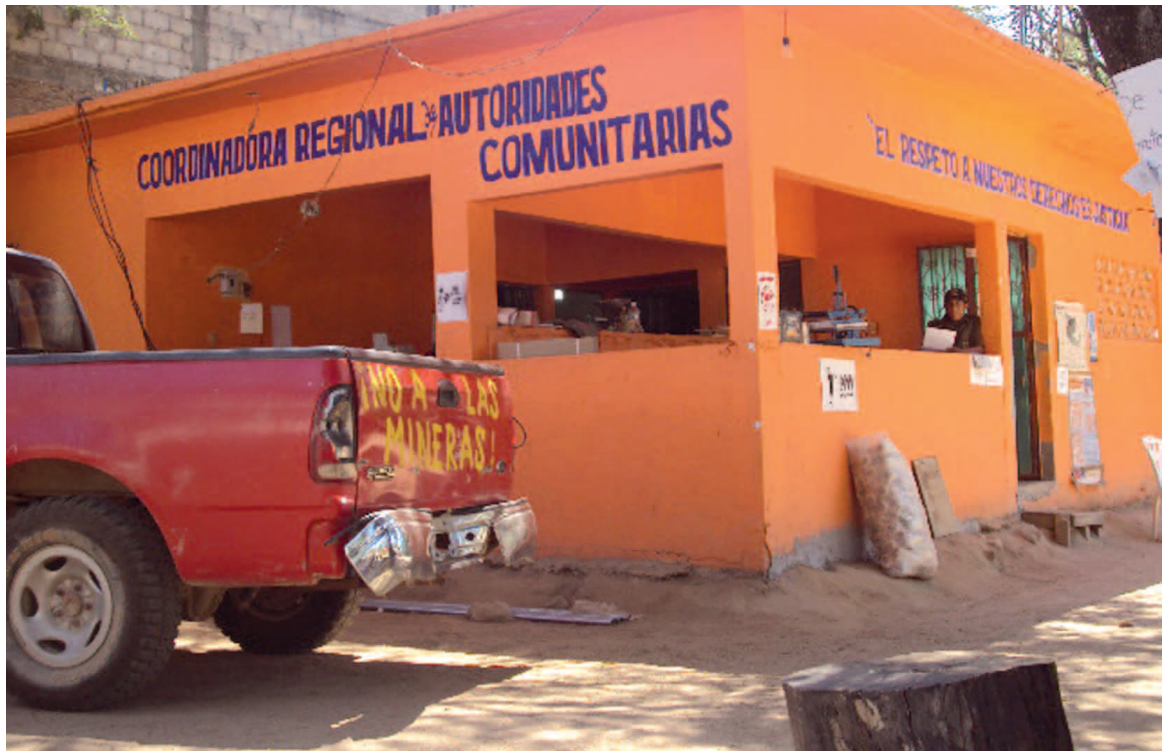
"No mining!" outside the office of the CRAC in Guerrero