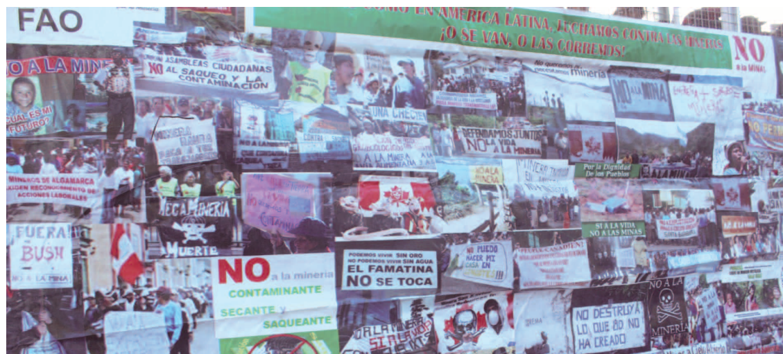
Signs against mining operations

siders that the international community's responsibility is undeniable. "If gold prices go up in the international stock exchanges, more mining companies come to Mexico and destroy us. Everyone buys gold now to secure their savings these days, or for ornaments, or as a gift. The international community must understand what extraction means; it should know that what is being purchased destroys places where people live and the lives of others. They are buying gold with blood." ■