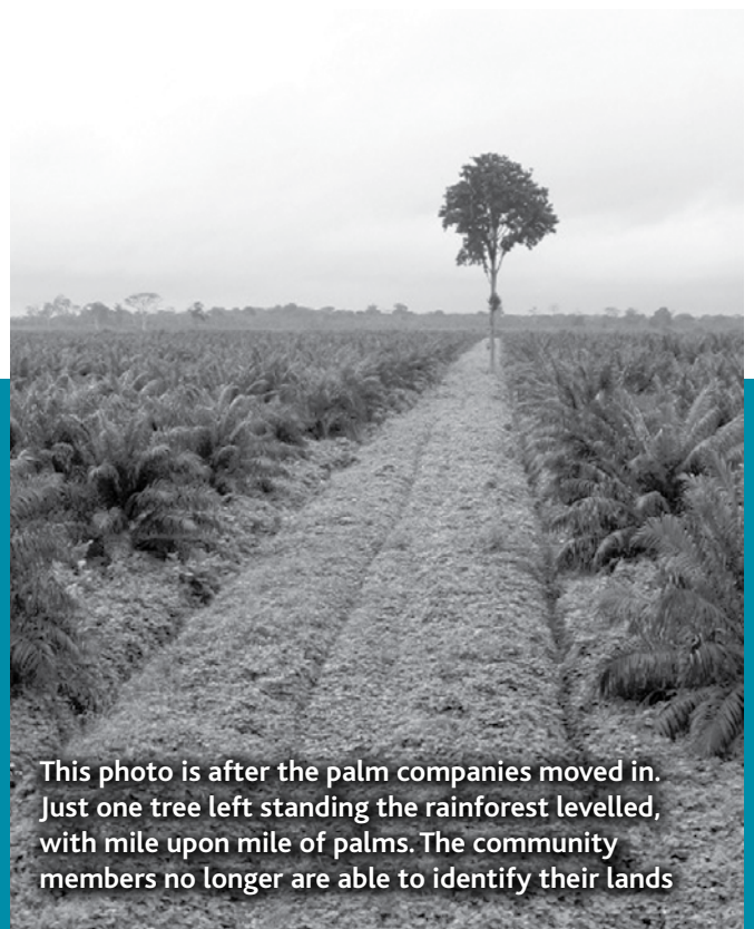
This photo is after the palm companies moved in. Just one tree left standing the rainforest levelled, with mile upon mile of palms. The community members no longer are able to identify their lands