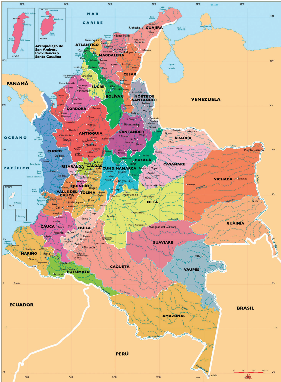
Departments of Colombia

The report's findings, conclusions and recommendations are based on internationally recognised standards for human rights and access to justice, such as the Universal Declaration of Human Rights 4 , the International Covenant on Civil and Political Rights 5 , the United Nations Basic Principles on the Role of Lawyers 6 and the Basic Principles on the Independence of the Judiciary. 7