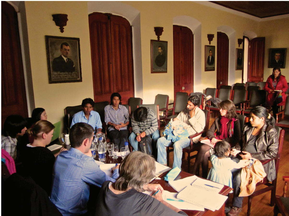
Caravanistas meet with people affected by mining in Nariño

Delegates who spoke to representatives of indigenous communities and their lawyers were advised that mining operations take place on the lands of affected indigenous peoples without the free, prior and informed consent of affected populations, or even prior consultation. Chemicals, especially mercury, used during the mining process often pollute rivers and land, affecting the health of the local people and their agricultural products. As a result of the adverse effects on their ancestral lands, mining has a negative impact on the cultural rights and survival of indigenous populations as distinctive peoples. Moreover, in their endeavours to uphold these rights, indigenous peoples and their leaders frequently face threats and attacks on their most fundamental rights. Given the significant and projected upsurge in the growth of the mining and extractive industry, the foregoing trends raise serious concerns about the failure of the Colombian state to protect the human rights and constitutional rights of its indigenous peoples.