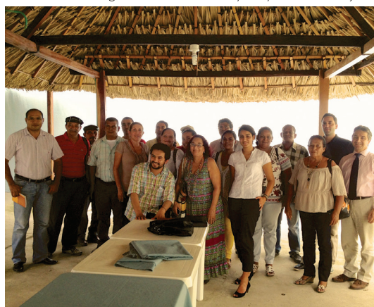
Caravana delegates meet community lawyers in Sincelejo