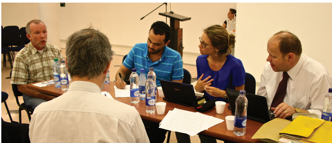
Caravanistas meet with Judge Solano

The 2012 Caravana was further informed that the stigmatisation and unfounded prosecution suffered by Judge Solano threatens the independence of the judiciary in the whole of Bucaramanga. Judges from this part of Colombia are now unwilling to grant habeus corpus applications to those who are detained, in any case, regardless of merit, due to the risk that they themselves may face prosecution.