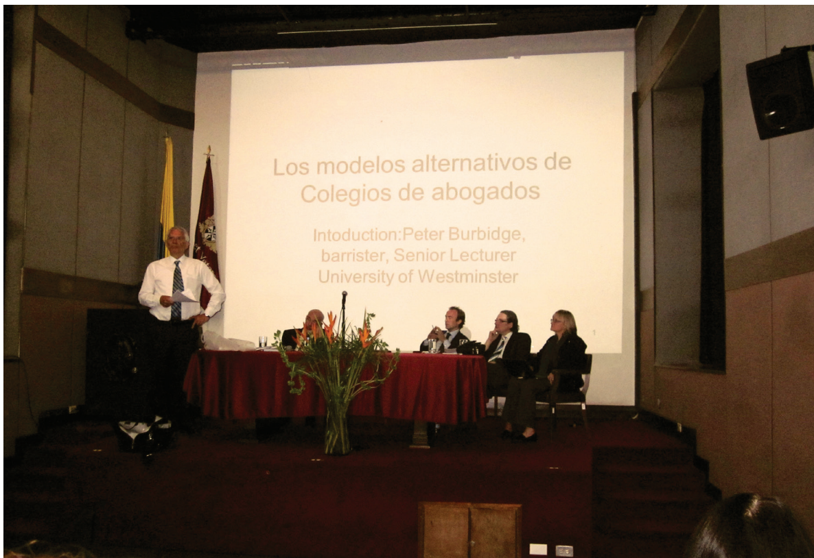
Caravana presentation to human rights lawyers in Bogotá

However, when the delegation raised this issue with the three separate agencies listed below, it received three different answers: The UNP's position is that petrol is not to be considered a protective measure; the Presidential Programme said that a lack of petrol is purely down to budget constraints; and the Human Rights Directorate defended the provision of petrol as being sufficient, although they noted that an increased allowance could be applied for, subject to justification.