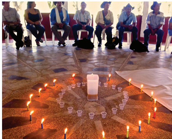
Community leaders in Yopal launch a protection organisation

Following the failure of the Colombian State to fulfil its obligations to investigate and prosecute attacks on human rights defenders and to address systemic patterns of impunity, the State has also breached its duties under international human rights law to protect lawyers, human rights defenders and other civil society actors who are at risk as a result of their work or associations.