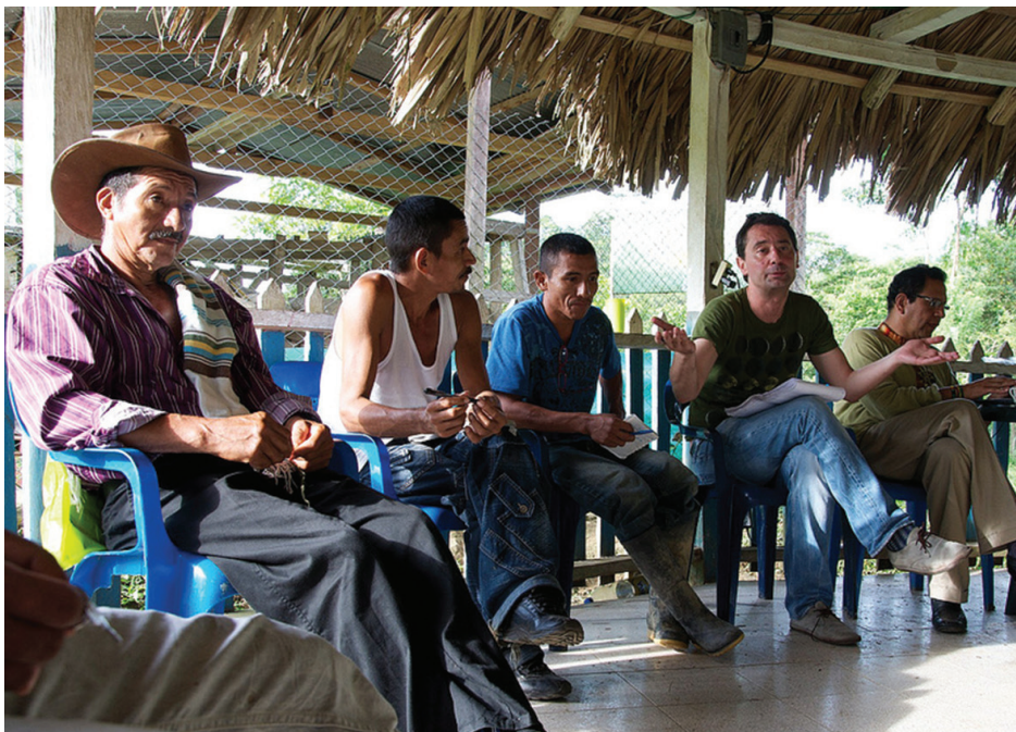
Caravanistas meet Peace Community leaders

Human rights defenders, including lawyers, are victimised in Colombia. They are victims of death threats made through telephone calls, emails, pamphlets and graffiti - in which they are accused of being guerrillas and opponents of state policies. In addition, they have been reportedly subjected to illegal wiretappings, raids on the organisations that they belong to, information theft and judicial harassment. The charges against them are based on intelligence reports compiled by the (now defunct) DAS 29 , the military, and the police. Despite repeated recommendations in reports by the Office of the UN High Commissioner for Human Rights, the Colombian State refused to declassify these intelligence reports. Hence, human rights defenders continue to be persecuted for their work despite the sector's legitimate and essential role in protecting basic rights and strengthening the democratic institutions of Colombia.