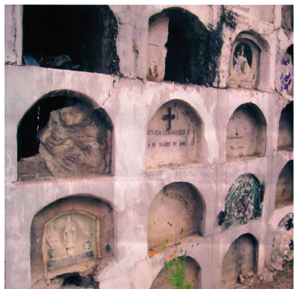
Image of Graveyard - Sent as part of a death threat