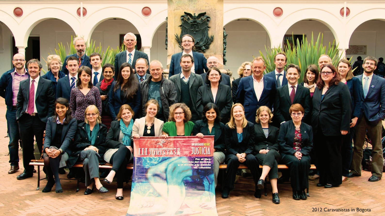
2012 Caravanistas in Bogota