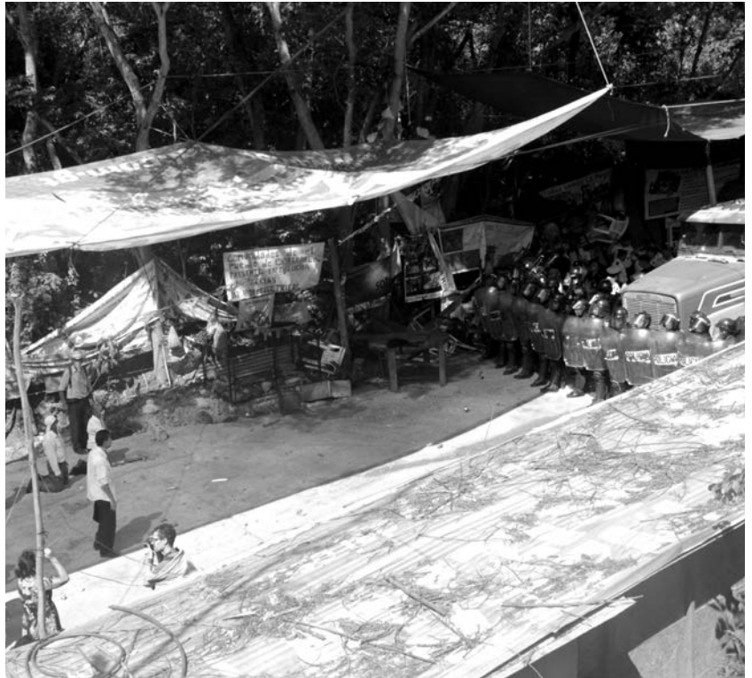
Police forces prepare to evict the protest camp in La Puya, after two years of peaceful resistance, 23.05.2014