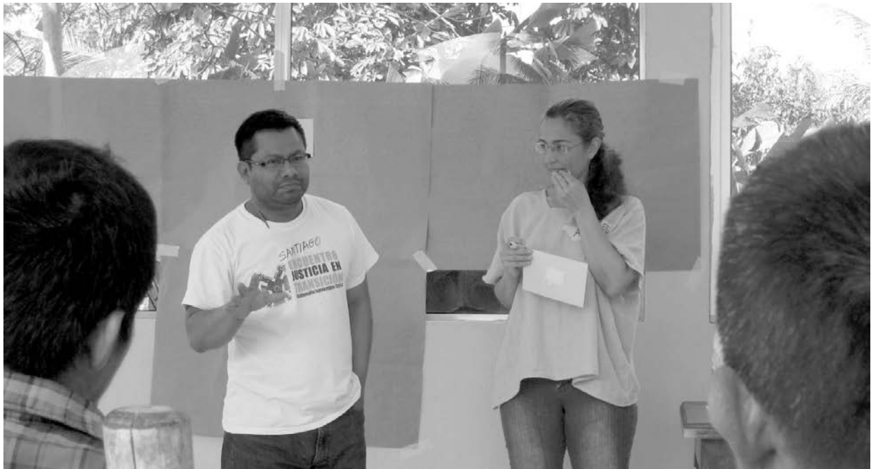
Working with victims and witnesses of the Panzós massacre, 15.02.2014

We received a lot of slander and threats just for representing the victims. They have called us lawyer or judicial