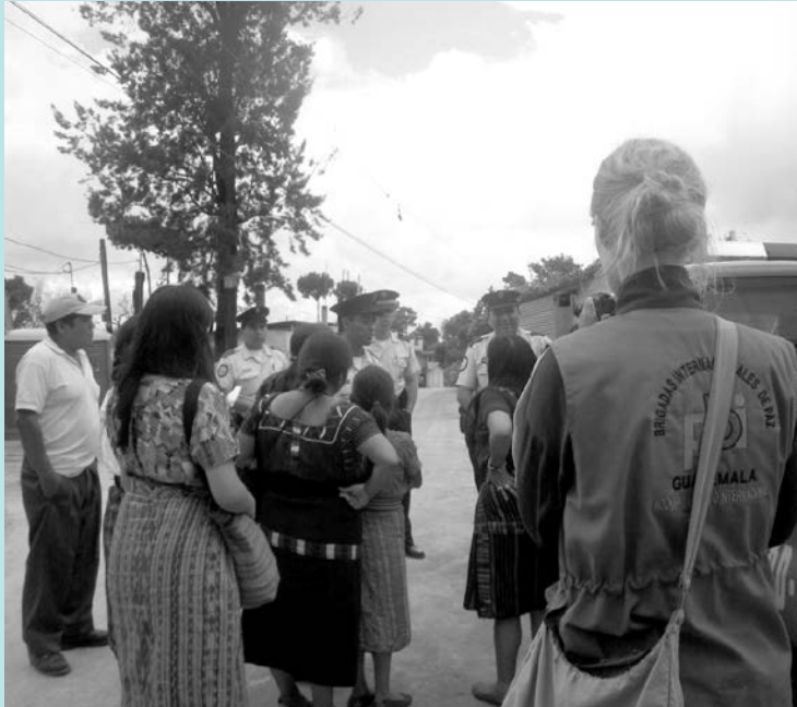
International Observation of a female delegation of human rights defenders in San Juan Sacatepequez, 14.10.2014.

On the 14th October, we accompanied another human rights delegation visiting several communities in San Juan Sacatepequez. This delegation was made up of organisations