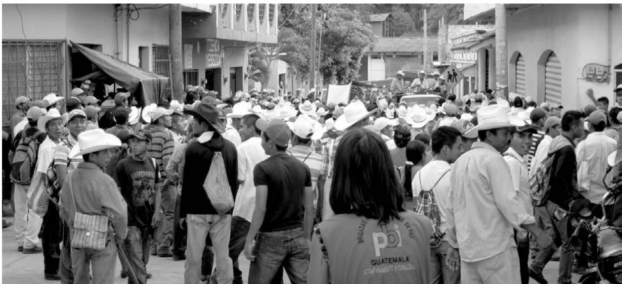
Demonstration in Jocotán, department of Chiquimula, 28.07.2014